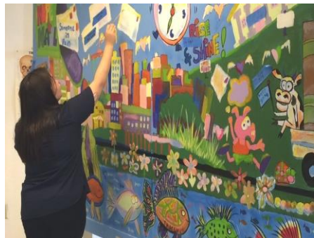
Youth Painting Courthouse Mural

730 Halstead Road Wilmington, DE 19803 302-478-2384